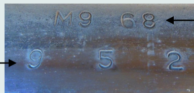
September 5, 1968, Second shift