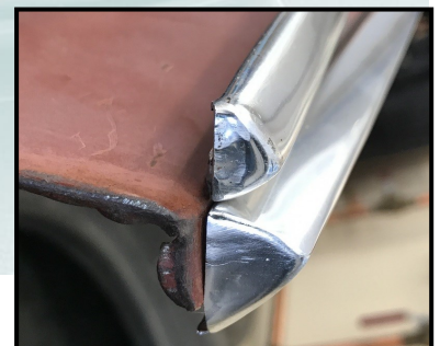
1969 and 1970 hood lip moulding shown side by side for comparison. The smaller one (above) is for a 1970.

An excellent reproduction of the Hood Lip Moulding support is available today thru Muscle Car Research: